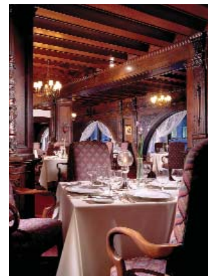
The Oakroom's dining area was once the gentlemen's billiards hall at the hotel.

"The meetings always provide a comprehensive review of all key issues facing pharmacy today, with a nice technology perspective."